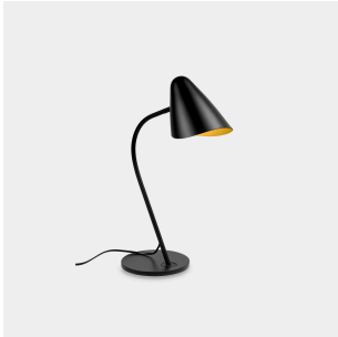
Table lamp Organic E27 23W Metallic black