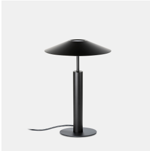
Table lamp H LED 14.9W 2700K Metallic black 553lm