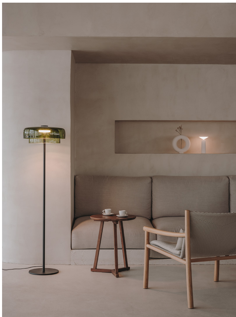
Image may not match reference. LedsC4 reserves the right to amend any of the product's components. The data related to flux, power and colour temperature may be subject to changes made by the manufacturer.