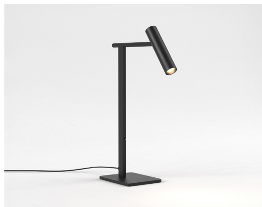
CODE: 1457002 FINISH: MATT BLACK

To maintain this product to its best condition, please view our care and cleaning guide on the support section of the astro website.