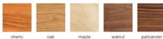
cherry oak maple walnut palisander